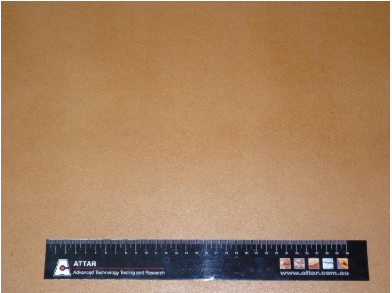
Figure 1: Intergrain UltraDeck Timber Oil – 2 coats with 5% Intergrain UltraGrip added to each coat applied to MDF board.